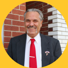
Nick Guccione, Mayor

Please use the information below to connect with the Mayor or the aldermen for your ward. Unsure which ward you live in? Visit www.wentzvillemo.gov/WardMap . The Board typically meets on the second and fourth Wednesday of each month at 6 p.m. at City Hall. To learn more, please visit www.wentzvillemo.gov/BOA .