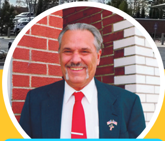
Mayor Nick Guccione