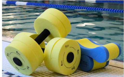
Aquatic Fitness Jan. 6