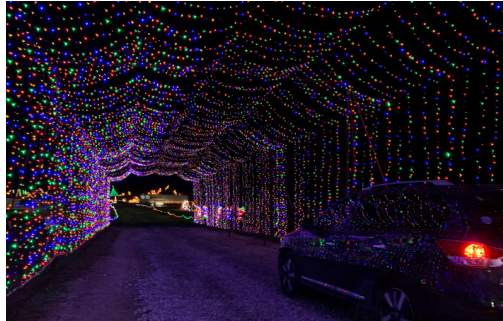
Holiday Night Lights Open Until Dec. 30