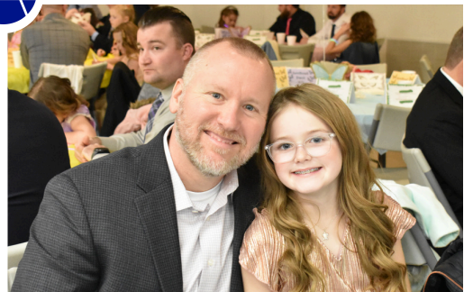
Sweetheart Dance Jan. 31 and Feb. 1