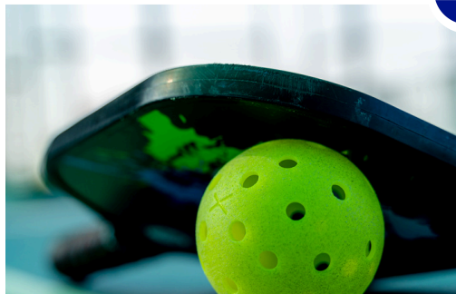
Pickleball League Jan. 12