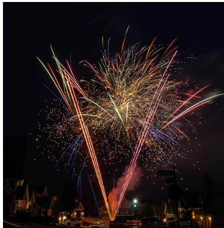
Second-Place: Kelly Sibley