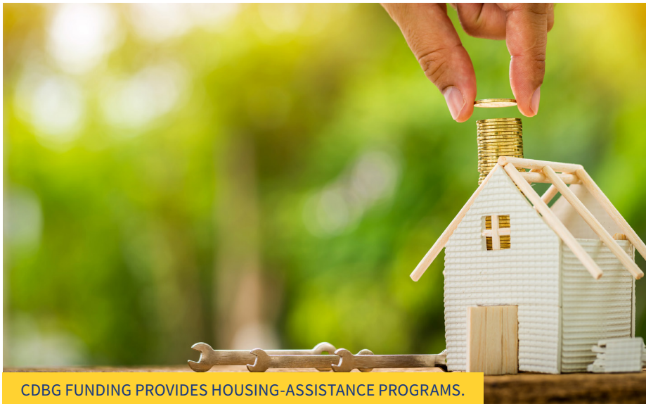
CDBG FUNDING PROVIDES HOUSING-ASSISTANCE PROGRAMS.