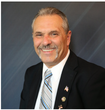
Mayor Nick Guccione