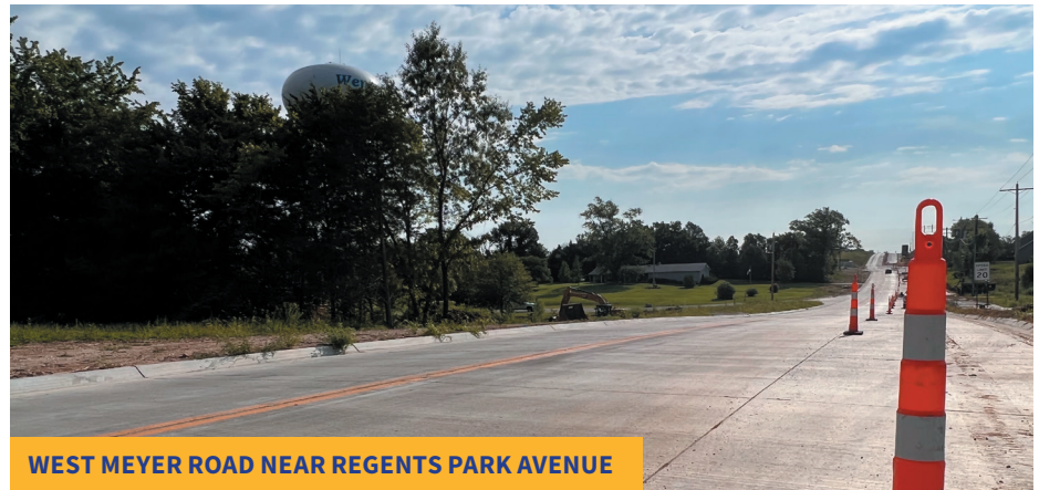
WEST MEYER ROAD NEAR REGENTS PARK AVENUE