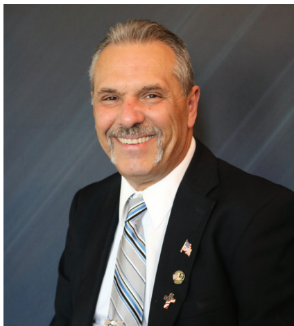
Mayor Nick Guccione