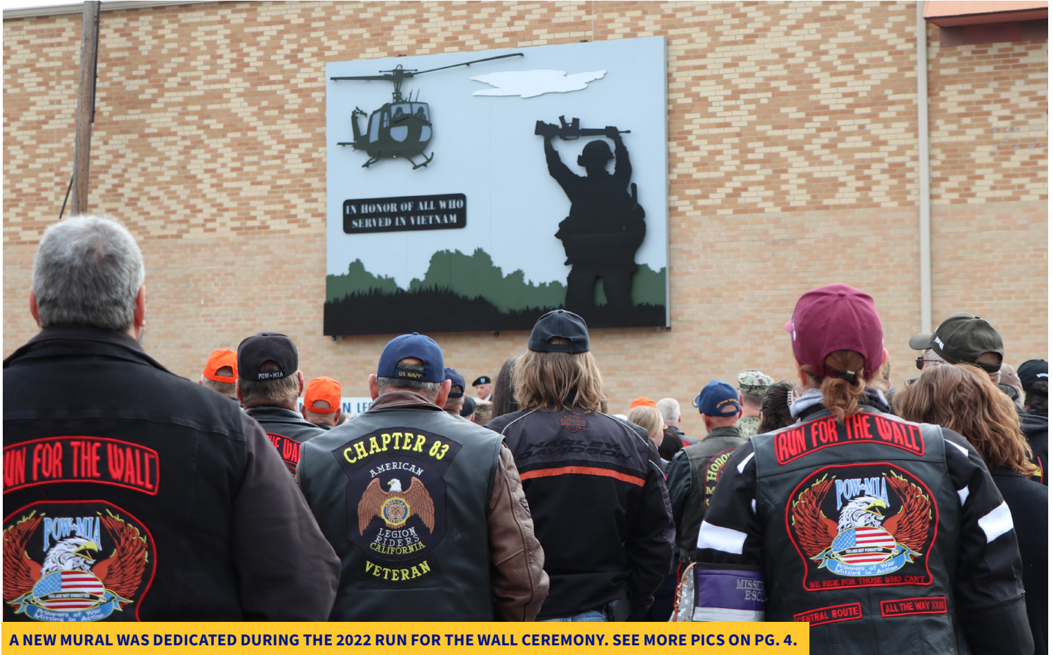
A NEW MURAL WAS DEDICATED DURING THE 2022 RUN FOR THE WALL CEREMONY. SEE MORE PICS ON PG. 4.