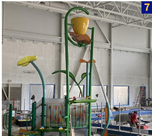
Photos: 1) front entrance; 2) main hallway; 3) Lindenwood space; 4) two-story slide; 5) offices; 6) entrance sign; 7) leisure pool area.