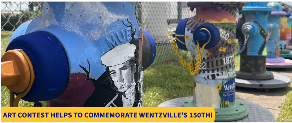
ART CONTEST HELPS TO COMMEMORATE WENTZVILLE'S 150TH!