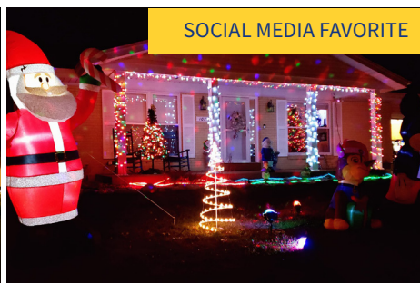
SOCIAL MEDIA FAVORITE