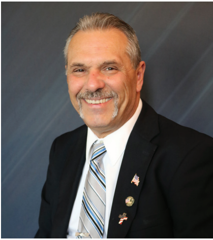
Mayor Nick Guccione