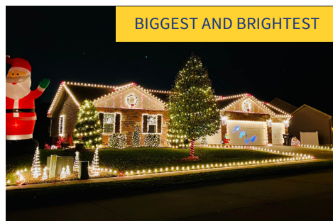
BIGGEST AND BRIGHTEST

To end the year on a high note, the City held its second annual Holiday Decorating Contest. The contest was open to Wentzville residents and three award winners were selected. In its second year, the contest had more than one dozen entries and hundreds of votes. Thank you to everyone who participated (and voted), we can't wait to bring this fun program back again next year!