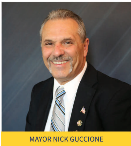
MAYOR NICK GUCCIONE