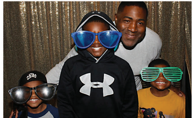
PHOTOS (clockwise): Sunrise at the WREC overlooking Heartland View Apartments; the Aging Ahead Senior Center space; Parks and Recreation staff at the ribbon-cutting ceremony; a family enjoying the photo booth during the event; and the Wentzville Honor Guard participating in the Grand Opening festivities.

The wait is over! The Wentzville Rec Center (WREC) is now open! For details about passes, hours, amenities and more please visit www.wentzvillemo.gov/WREC or call the Parks and Recreation Department at (636) 332-9236.