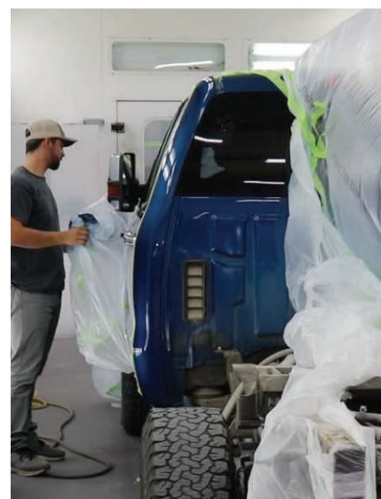
A LOOK INSIDE CARSTAR AUTO BODY.

To view all of the Connecting at the Crossroads videos, check out our YouTube channel at www.wentzvillemo.gov/catc .