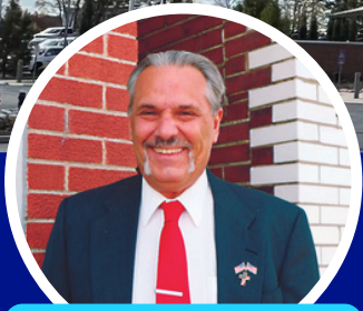
Mayor Nick Guccione