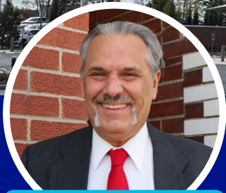
Mayor Nick Guccione